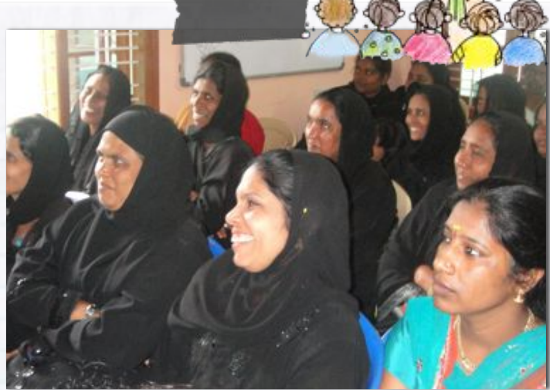
Education Loan Interest Refund. KB Sandra Branch 101 Beneficiaries benefited!